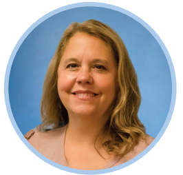
Leslie Burke Event Sponsorships & Grants